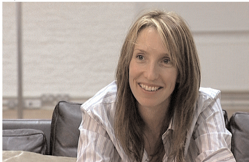
Sam Taylor-Wood

CANADIAN ART FOUNDATION 210-57 FRONT ST E PO BOX 20204 STN BSM B TORONTO ON M7Y 3R1