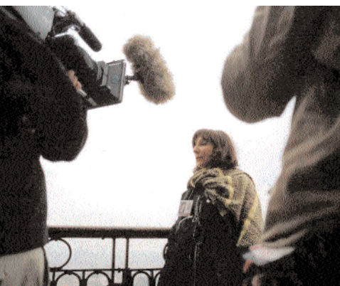
Sophie Calle

All screenings and the Video Art in Canada event are at the AL GREEN THEATRE, Miles NadaL JCC, 750 Spadina Avenue (at Bloor Street), Toronto.