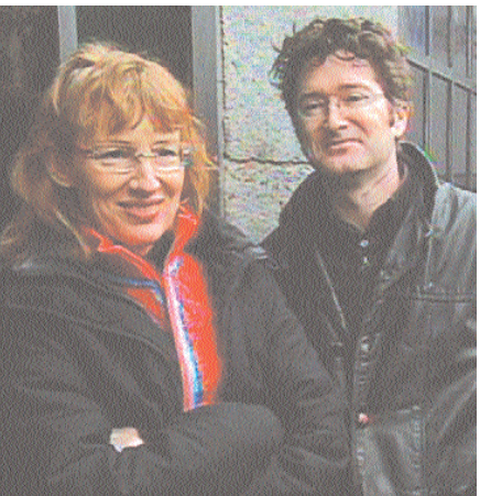
Walk with Us Barlin Productions

The Canadian Art Foundation thanks our supporters for their generosity