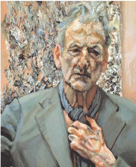
Lucian Freud Reflection—Self Portrait

Friday February 24 Saturday February 25 and Sunday February 26