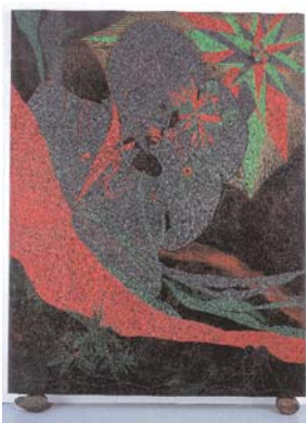
Chris Ofili Afro Jezebel