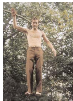
Sam Taylor-Wood The Leap

Friday February 24 Saturday February 25 and Sunday February 26