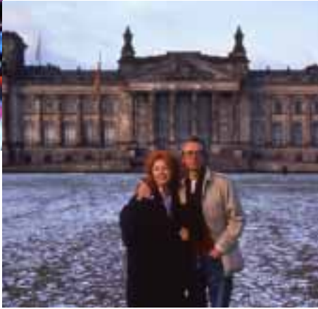
Christo and Jeanne-Claude