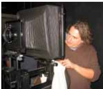
Gregory Crewdson: The Aesthetics of Repression, Michael Blackwood Productions

Canadian Art Foundation 416 368-8854 ext. 307