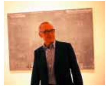
Gerhard Richter: Four Decades. Michael Blackwood Productions