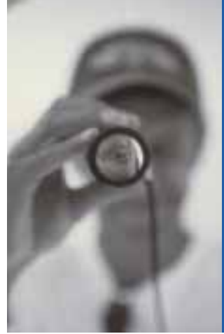
Worst Possible Illusion: The Curiosity Cabinet of Vik Muniz, Anne-Marie Russell