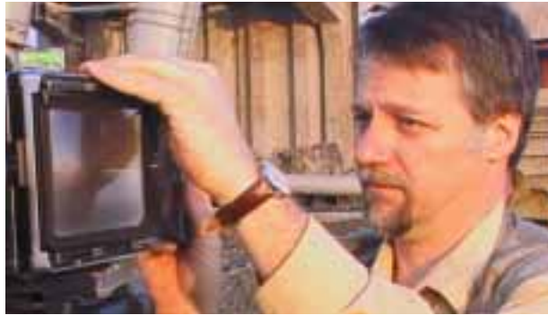
Ed Burtynsky, Jennifer Baichwal and Nick de Pencier