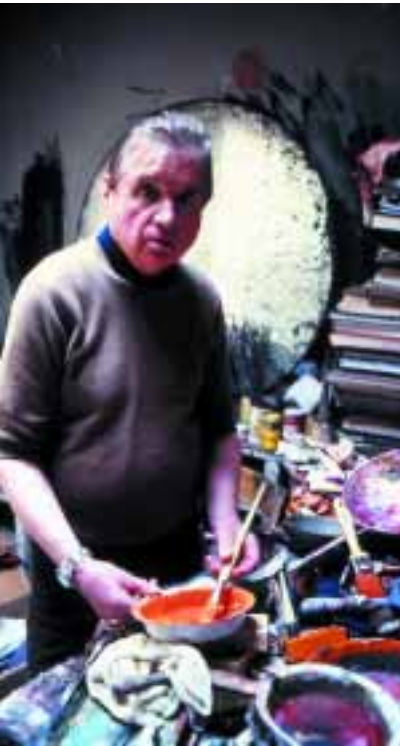
Francis Bacon: The Brutality of Fact, Michael Blackwood Productions