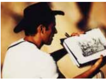
Worst Possible Illusion: The Curiosity Cabinet of Vik Muniz, Anne-Marie Russell