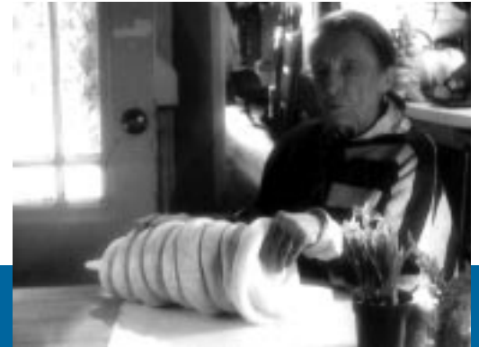
Chère Louise: A Portrait of Bourgeois, Brigitte Cornand

Baichwal/de Pencier shorts are from 40 x 40 , a series celebrating the fortieth anniversary of the Ontario Arts Council. Produced by Mercury Films Inc. in association with TVOntario and the OAC.