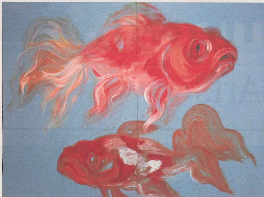
Flying to the Moon —gold fish combines simplicity of form with intricacy of gesture. BRUCE SPIELMAN

On the Edge of Experience includes a room called "In the Studio" filled with juvenilia, sketches, Post-it notes, photographs, studio objects, books and single-channel videos, as well as 14 maquettes, made by Steve Hunter. The maquettes recreate in miniature Koop's major exhibitions of the past three decades. It is a captivating space, a combined archive and living museum that is like being inside the artist's imagination. The room offers a rich insight into the creative process without minimizing its essential mystery. What it