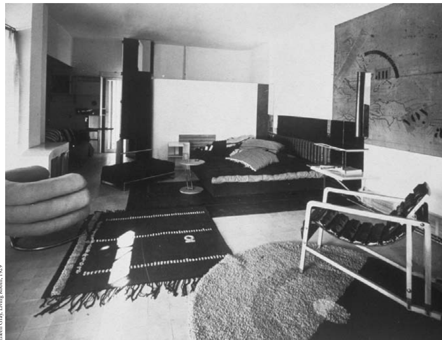
Eileen Gray, Living Room, 1929

Sunday, March 29, 4:15 pm Stanford Perrott Lecture Hall Main Mall, Alberta College of Art + Design