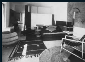
Eileen Gray: Designer & Architect