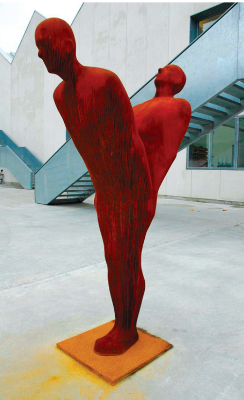
Antony Gormley, Refer Zero , 2004, cast iron, 181 x 45 x 111 cm. Edition of 5, Private collection, Germany.