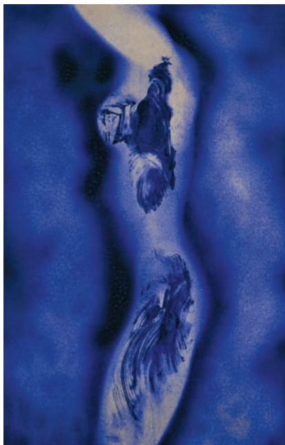
Yves Klein, Anthropométrie sans titre (ANT 148), 1960