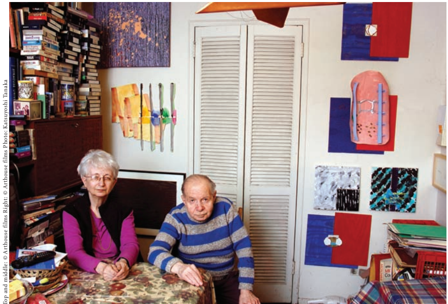
Top and middle: © Arthouse films. Right: © Arthouse films. Photo: Katayoshi Tanaka